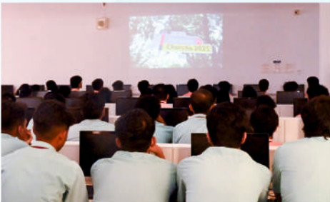
WIFI ENABLED COMPUTER LAB