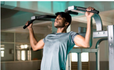
7 STAGE GYMNASIUM