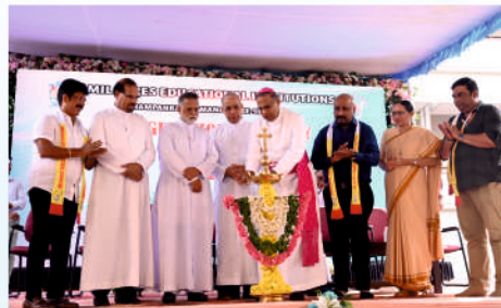
AVISHKAR INSTITUTIONAL FEST