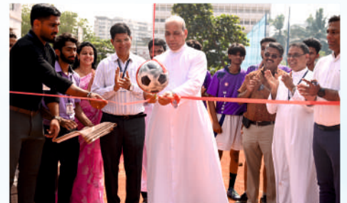
NEW FOOTBALL GROUND