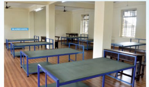
WELL FURNISHED HOSTELS FOR BOYS & GIRLS