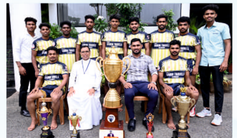
SPECIAL KABADDI COACHING