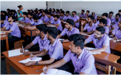
FULLY-EQUIPPED CLASS ROOMS

• Interior Designing With 3D & CAD (2 year) • Hospitality Management (2 year) • Flaring Skills & Mixology (6 Months)