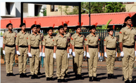
NATIONAL CADET CORPS (NCC) UNIT