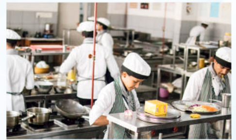
F&D PRODUCTION LAB