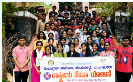
NATIONAL SERVICE SCHEME (NSS) UNIT