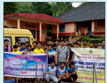
NSS Flood Relief Camp