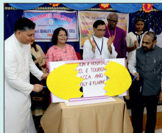
Add on inauguration