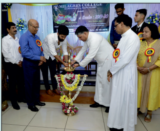
Navrang & Excelso