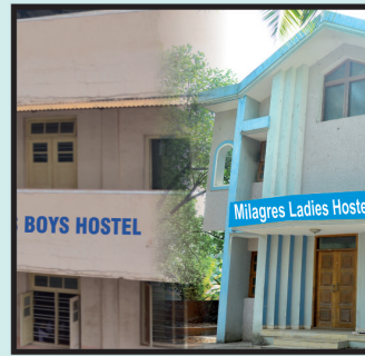
Hostels for Gents and Ladies