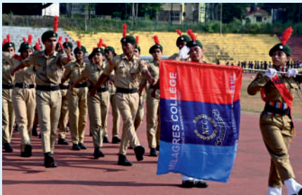
NATIONAL CADET CORPS (NCC) UNIT