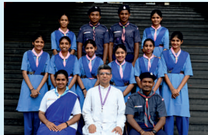
ROVERS AND RANGERS