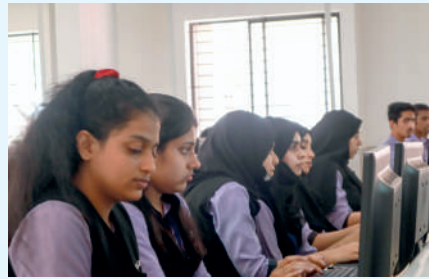
WELL- EQUIPPED COMPUTER LAB