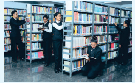
FULLY- EQUIPPED LIBRARY