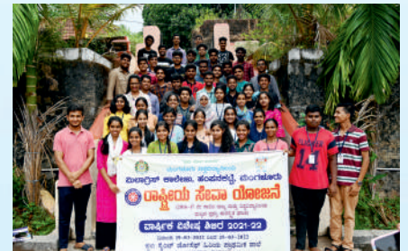
NATIONAL SERVICE SCHEME (NSS) UNIT